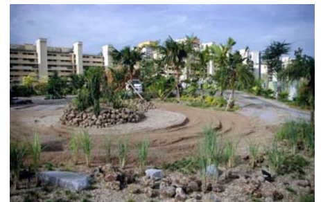
The sand track allows a smooth gliding. Rocks, wooden sleepers, etc. were also integrated within the circuit.