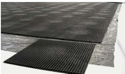
Elastodrain® EL 202 was fully laid above the Slip Sheet TGF 20.