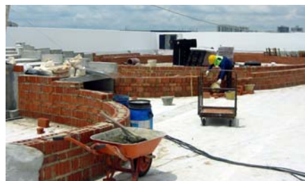
Features such as ramps and bridges were built on top of the protection and drainage layer.