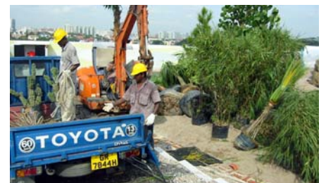
Local palm trees were planted in a 1,20 m deep substrate layer.