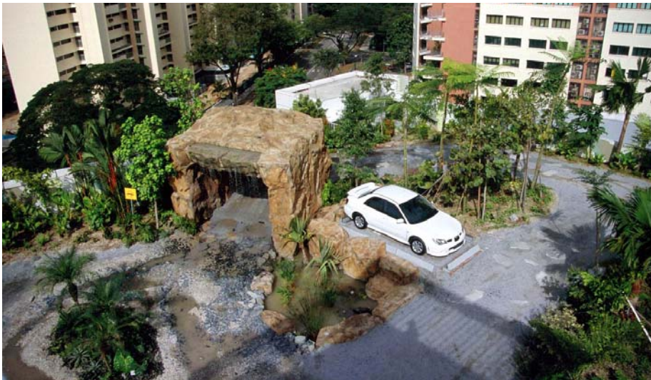
All-wheel driving pleasure on the Subaru roof top in Singapore.