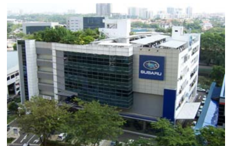
View from a neighbouring building onto the roof of Subaru headquarters.

the circuit, such as humps, rocks, a sand trail and even a waterfall. The all-wheel drive test track was installed on top of the heavy duty drainage element Elastodrain® EL 202, which offers excellent protection to the waterproofing membrane and even caters for wild cornering. Besides, it provides for perfect drainage, most important during heavy tropical rain.